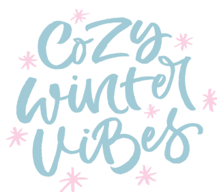
P6 Pantone 551C Pantone 656C