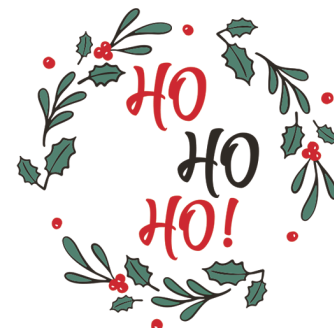
P12 Pantone 625C Pantone BlackC Pantone 711C