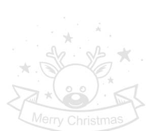
P4 Pantone srebrno-podobny