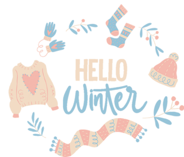
P10 Pantone 475C Pantone 550C Pantone 488C