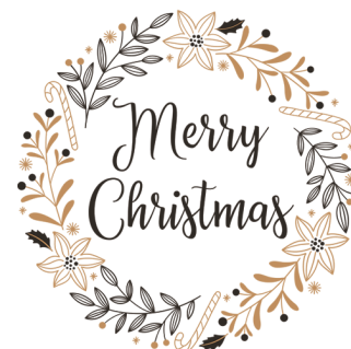
P11 Pantone 729C Pantone BlackC