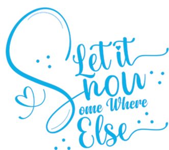
P7 Pantone 298C