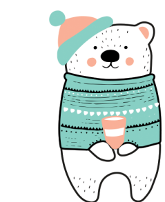
P2 Pantone 564C Pantone 487C Pantone Black 6C