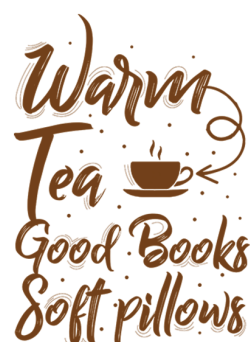
P8 Pantone 1545C