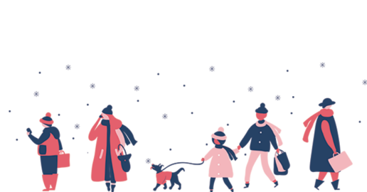
P1 Pantone 709C Pantone 495C Pantone 534C