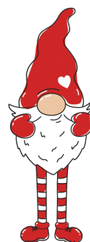
P18 Pantone 1795C Pantone 719C Pantone Neutral BlackC