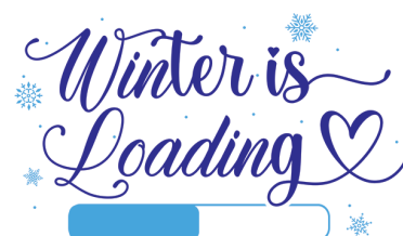
P9 Pantone 7688C Pantone 2747C