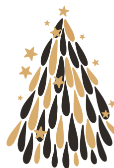
P17 Pantone 7509C Pantone BlackC