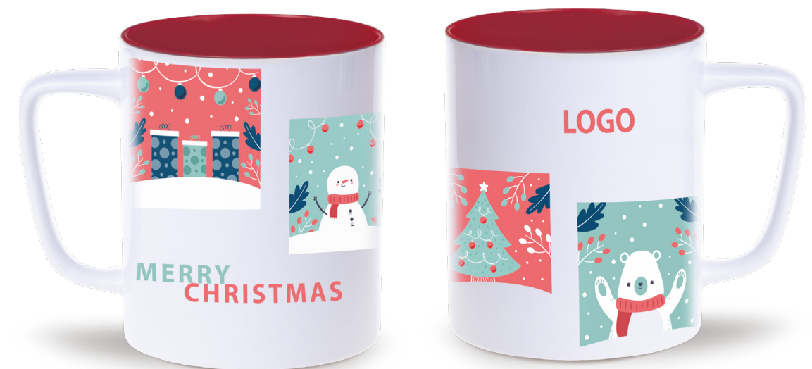
Tommy Art with the motif A1