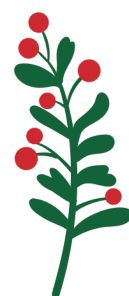
P15 Pantone 7483C Pantone 711C