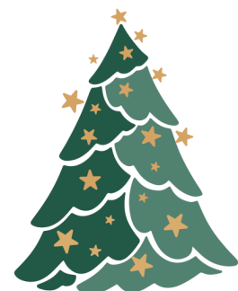
P13 Pantone 626C Pantone 625C Pantone 7509C