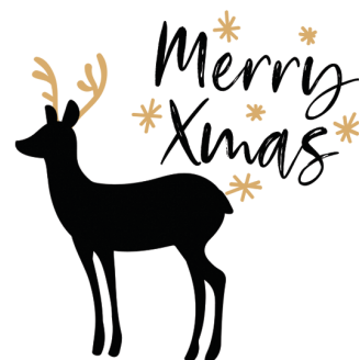
P3 Pantone Black 6C Pantone 7509C