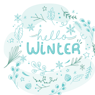
P16 Pantone 325C Pantone 556C Pantone 656C