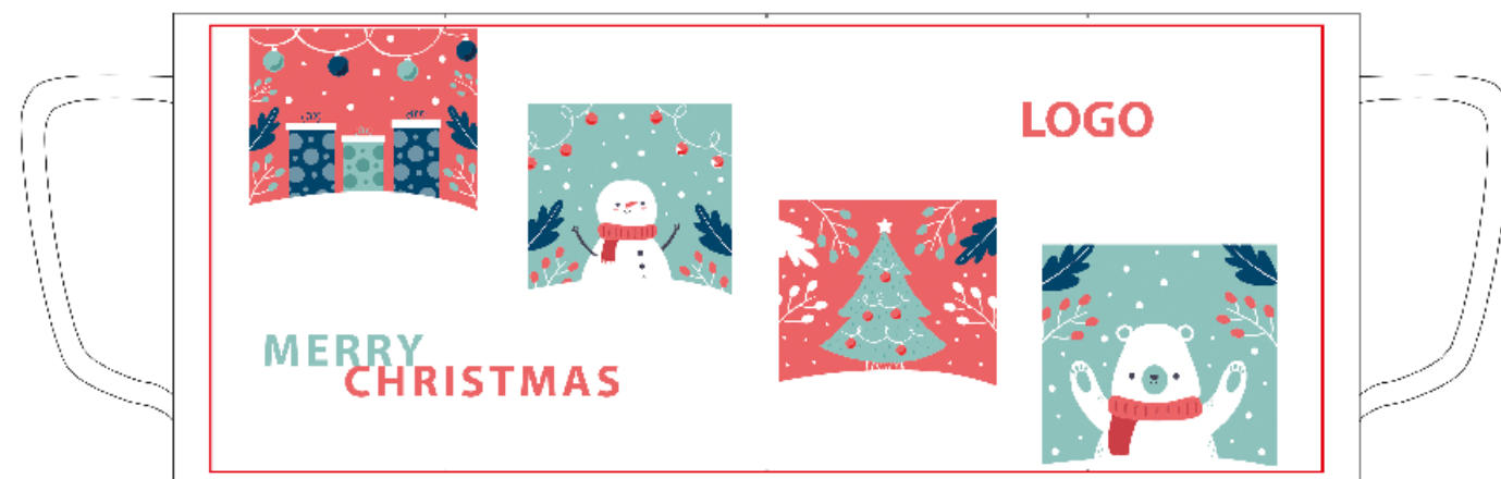
Art Print (Sublimation) A1

For the selected motif, choose the product proposed below or any of the Porcelaine by Maxim sublimation mugs. Include logo placement, and you're done!