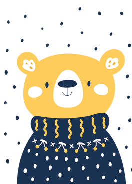
P5 Pantone 141C Pantone 2767C Pantone 663C