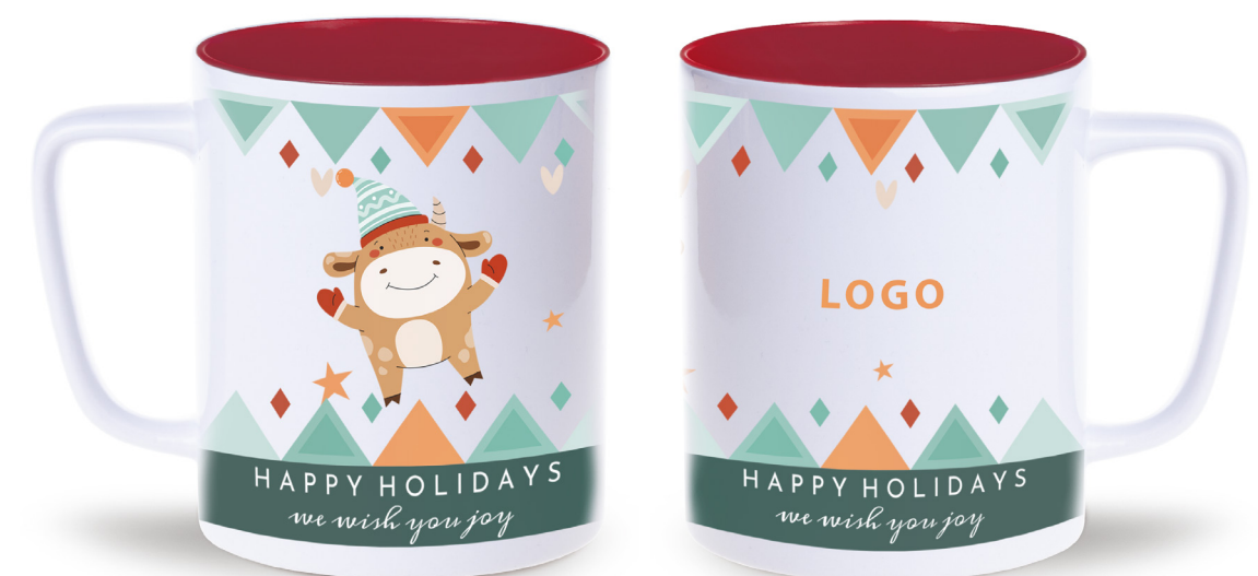
Tommy Art with the motif A2