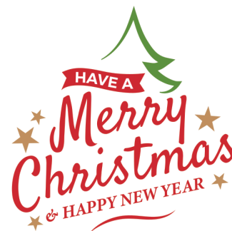
P14 Pantone 7490C Pantone 711C Pantone 729C