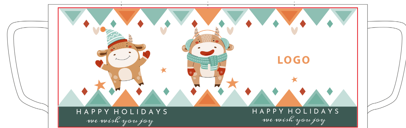
Art Print (Sublimation) A2